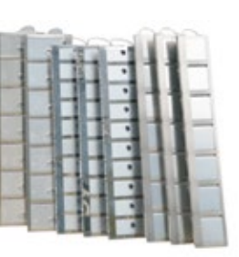
Frame with blood bag boxes